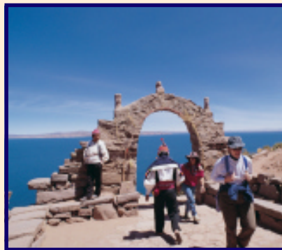
Taquile Island, Puno

The National Institute of Culture in Puno presented its technical report for this proposal to the world organization. The only way to reach the island is a three-hour voyage by boat. After landing, the visitor must climb 567 steps up to the center of the village, at 3950 m.a.s.l.