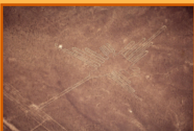
Nasca Lines, Ica