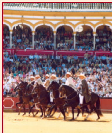
Peruvian Pacer Horse in Sevilla, Spain.

Peru's Banner Products, Pisco and the Pacer Horse, were presented in Madrid and Sevilla, Spain, to diplomats, European authorities, recognized vintners and sommeliers.