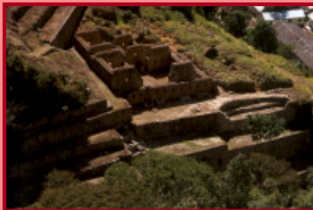
Temple of Choquesuysuy, Cusco

Living cultures exist within modern Peru and help understand its rich past