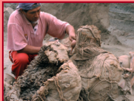
Archaeological site of Puruchuco, Lima

And later, in mid-2002, there was the discovery of thousands of mummies from the end of the Inca Empire, buried in the archaeological area of Puruchuco, in Lima. While in Cajamarca, in northern Peru, a mission from the University of Tokyo and experts from